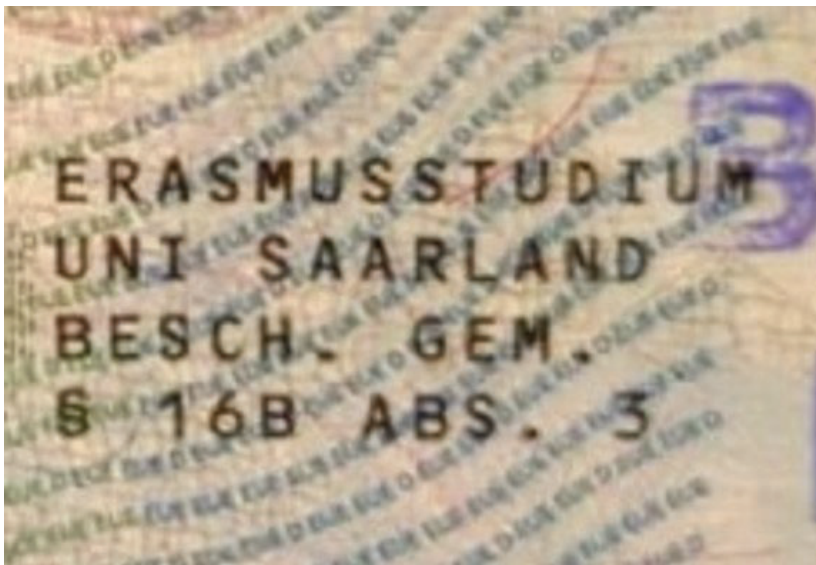
Abbildung 2: example 1 work permit