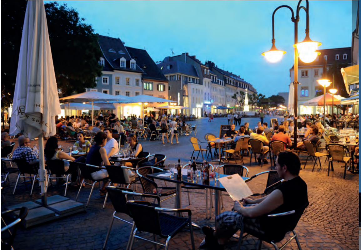
St. Johanner Markt is centrally located in the pedestrianized area of Saarbrücken and is a popular place to meet in the evenings.