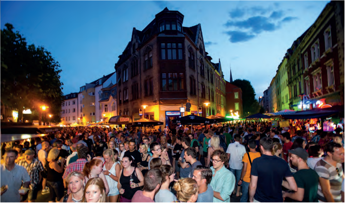
The Nauwieser Festival attracts plenty of students to this vibrant and dynamic part of Saarbrücken.

The river is at the focus of Saarbrücken's summer festival 'Saarspektakel' during which teams from Saarland University take part in the ever popular dragon boat races. Other summer events attracting thousands of visitors to the city are the Old Town Fair (Altstadtfest) and the Nauwieser Festival.