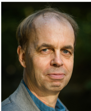
Claudius Gros (2017)

With the introduction of the attention mechanism in 2014/17, machine learning has seen an accelerating revolution, with the latest developments including the release of ChatGPT in the fall of 2022, the ongoing open-source explosion, and the development of concepts like 'tree of thoughts'. This lecture aims to present a basic but concise introduction to the technical foundations of generative AI.