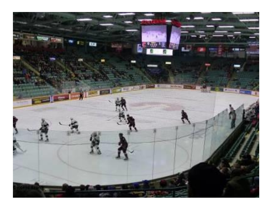
Cougars Hockey Game at the CN Centre

Overall I can only say that if you are looking to spend your semester abroad in a place with a beautiful landscape, lovely people, and interesting classes, and you prefer a bit of outdoor adventure over the feeling of a big city, UNBC just might be the right place for you. If you do have any more questions, feel free to ask the International Office for my contact information, I am happy to help! Other than that, good luck with your application, and I hope you will have a wonderful time during your time abroad!