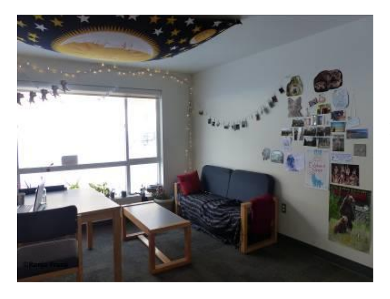
Residence Apartment – Common Area