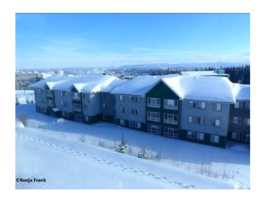
Residence Building – Neyoh